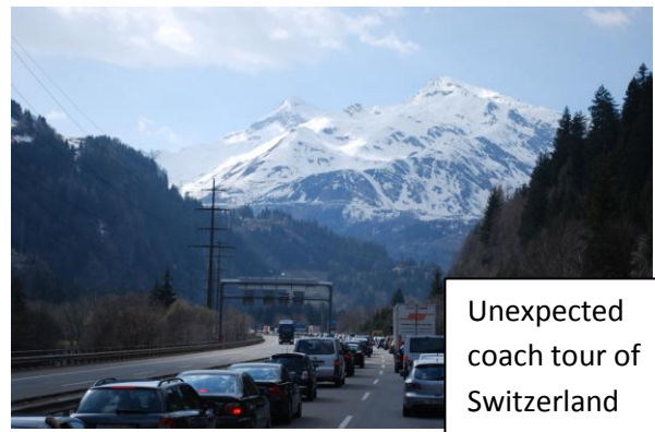
Unexpected coach tour of Switzerland